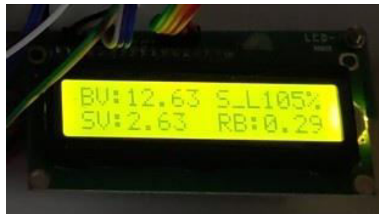
Fig 2 Image view of Experimental Output